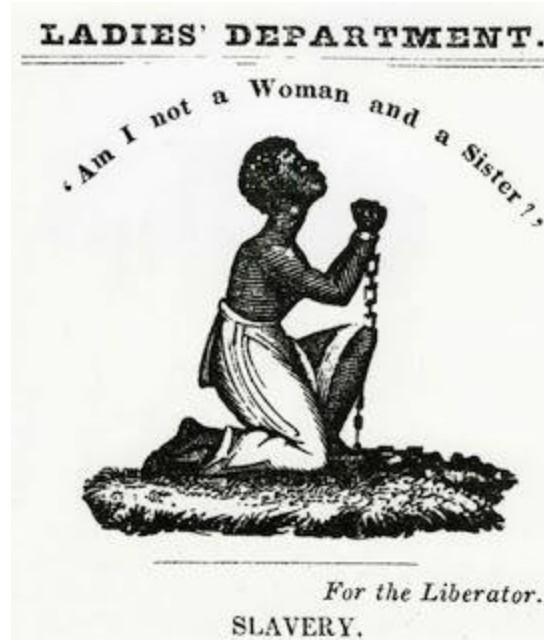
Image that appeared in William Lloyd Garrison's abolitionist newspaper, "The Liberator"

The northern abolitionist wants slavery abolished immediately in all states and wants it prohibited in the western territories. She worries that Texas coming in as a massive state will give it more votes in the House of Representatives, throwing off the balance of free and slave states represented.